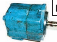
All Brands Hydraulic Motors

Cylinders • Pumps • Valves • Motor Repairs Bridgestone Hydraulic Hoses, Fittings and Oil