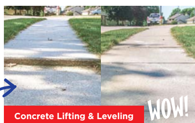
Concrete Lifting & Leveling