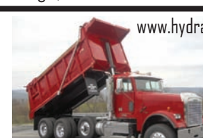
Lift Cylinder Repair