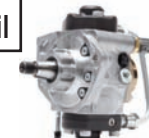
All Brands Gear, Vane Piston Pumps