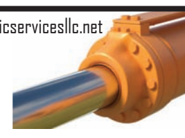
All Types of Cylinders