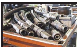
Bridgestone Hoses & Fittings