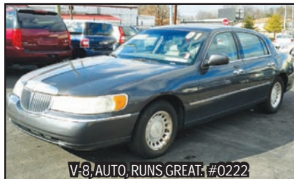
2001 LINCOLN TOWNCAR