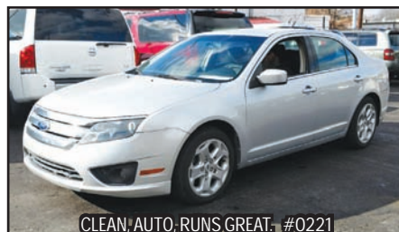
2011 FORD FUSION