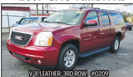
2007 GMC YUKON XL