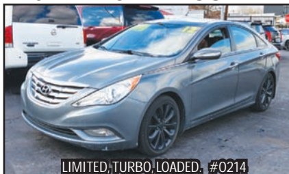
2012 HYUNDAI SONATA