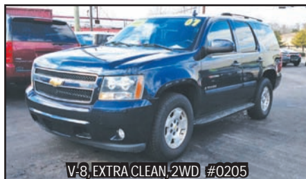
2007 CHEVROLET TAHOE