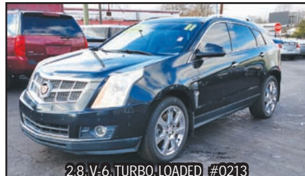
2011 CADILLAC SRX