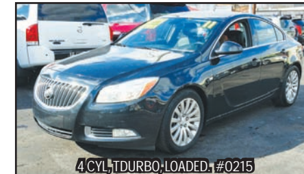
2011 BUICK REGAL