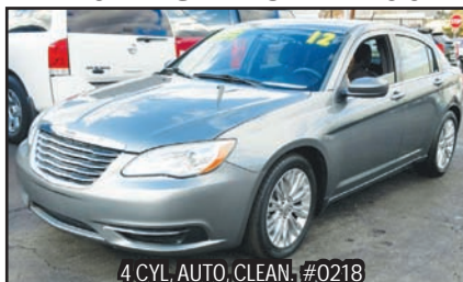
2012 CHRYSLER 200