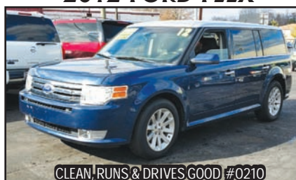
2012 FORD FLEX