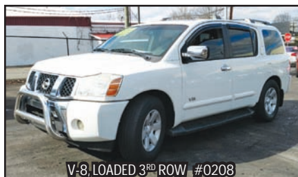
2007 NISSAN ARMADA LE