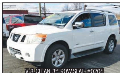
2009 NISSAN ARMADA SE