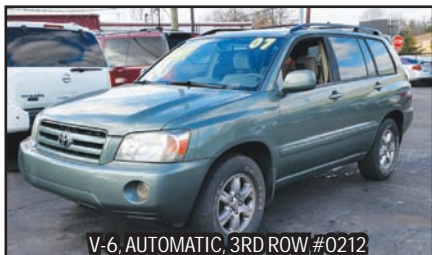
2007 TOYOTA HIGHLANDER