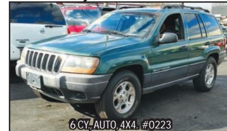
1999 JEEP CHEROKEE