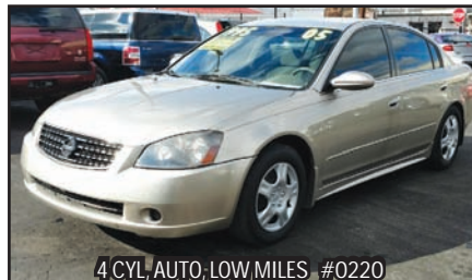
2005 NISSAN ALTIMA