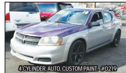
2014 DODGE AVENGER