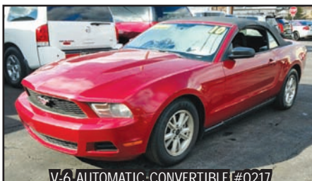
2010 FORD MUSTANG