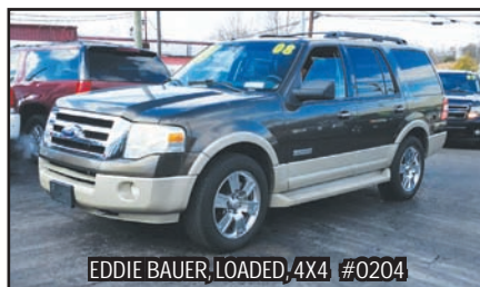
2008 FORD EXPEDITION