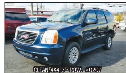
2007 GMC YUKON