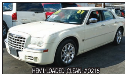
2007 CHRYSLER 300C