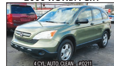
2008 HONDA CRV