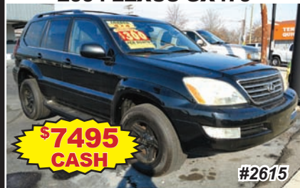
2004 LEXUS GX470