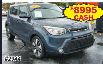
2015 KIA SOUL