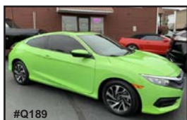
2017 HONDA CIVIC LX-P 2 dr coupe, black cloth interior, loaded with extras, 39MPG, Low miles, clean CarFax. Check out our website for more photos and price!