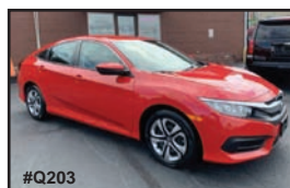
2018 HONDA CIVIC LX 4 door sedan, CVT, FWD.

Check out our website for more photos and price!