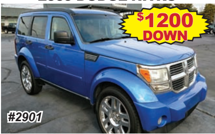
2009 DODGE NITRO