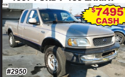
1997 FORD F-150 LARIAT

www.fannmotorsgallatin.com • And on FACEBOOK