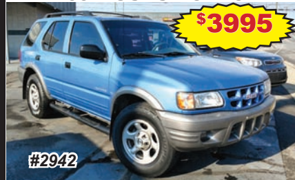
2001 ISUZU RODEO