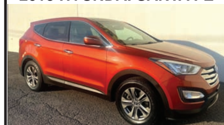
2013 HYUNDAI SANTA FE