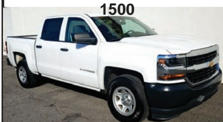
2016 CHEVY SILVERADO 1500