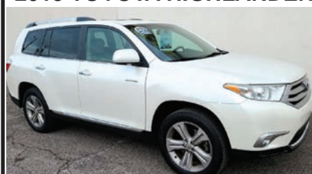
2013 TOYOTA HIGHLANDER