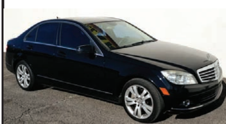
2010 MERCEDES BENZ