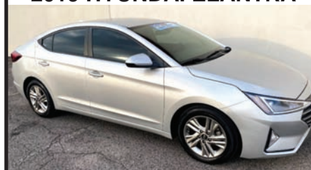
2019 HYUNDAI ELANTRA