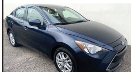
2018 TOYOTA YARIS iA