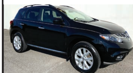
2013 NISSAN MURANO SL