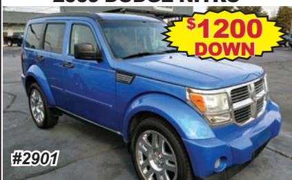
2009 DODGE NITRO