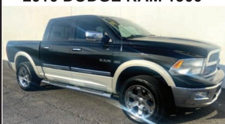
2010 DODGE RAM 1500