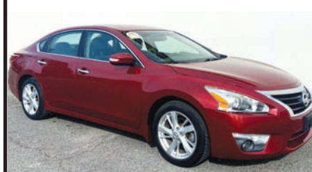
2013 NISSAN ALTIMA