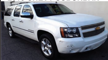
2010 CHEVY SUBURBAN