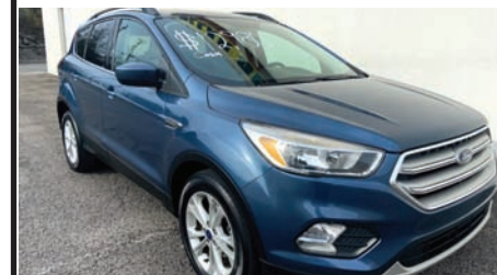
2018 FORD ESCAPE SE