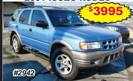
2001 ISUZU RODEO