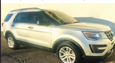
2017 FORD EXPLORER