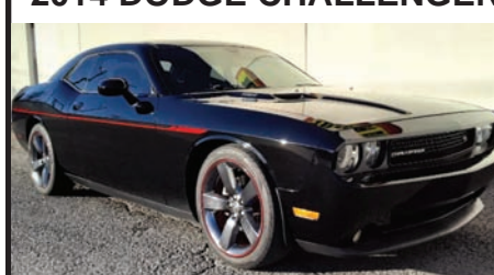
2014 DODGE CHALLENGER