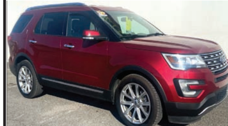
2016 FORD EXPLORER