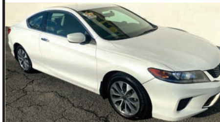
2014 HONDA ACCORD CPE