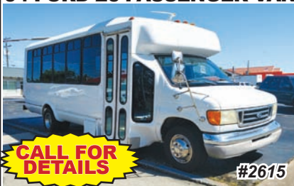
04 FORD 26 PASSENGER VAN