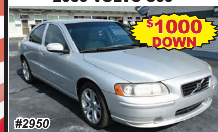
2009 VOLVO S60