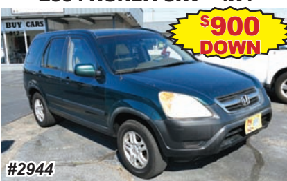
2004 HONDA CRV - 4X4