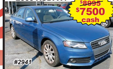
2009 AUDI A4