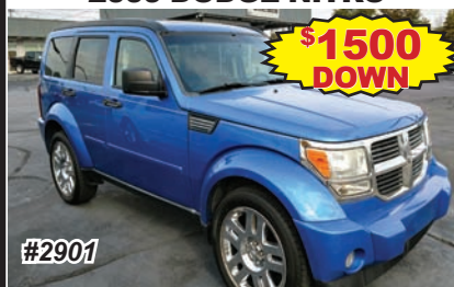
2009 DODGE NITRO

www.fannmotorsgallatin.com • And on FACEBOOK