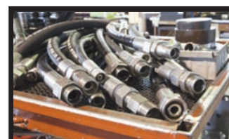
Bridgestone Hoses & Fittings

Serving Sumner, Macon, Trousdale Counties. Call for an estimate!