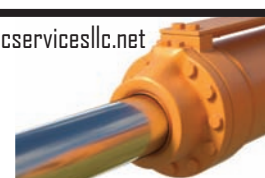
All Types of Cylinders