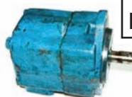
All Brands Hydraulic Motors

Cylinders • Pumps • Valves • Motor Repairs Bridgestone Hydraulic Hoses, Fittings and Oil