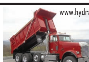
Lift Cylinder Repair