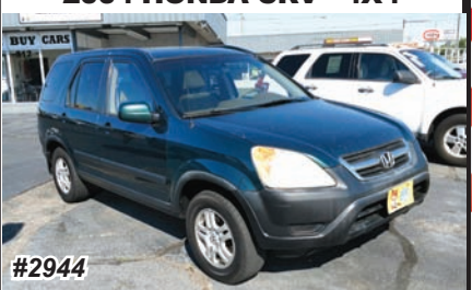
2004 HONDA CRV - 4X4