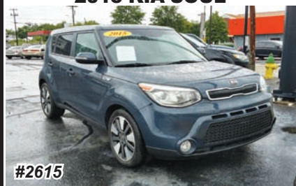
2015 KIA SOUL