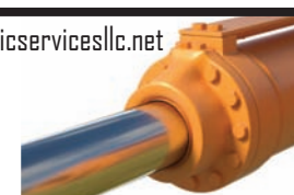
All Types of Cylinders