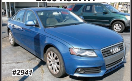
2009 AUDI A4