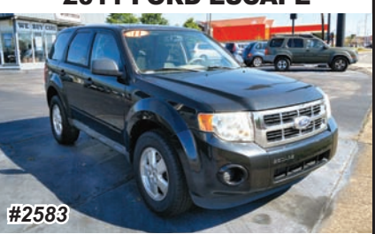
2011 FORD ESCAPE