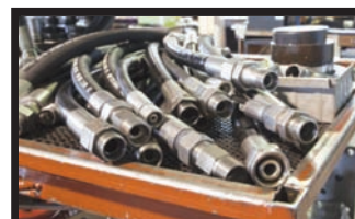
Bridgestone Hoses & Fittings

Serving Sumner, Macon, Trousdale Counties. Call for an estimate!