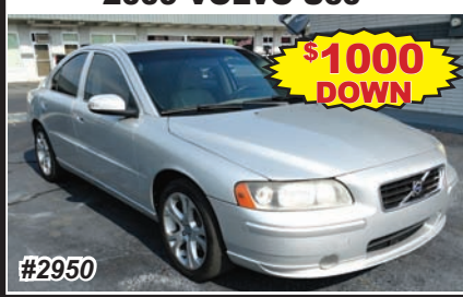
2009 VOLVO S60

www.fannmotorsgallatin.com • And on FACEBOOK