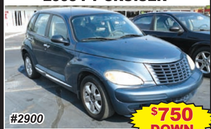
2003 PT CRUISER