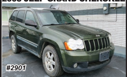
2008 JEEP GRAND CHEROKEE