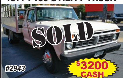
1977 F150 UTILITY TRUCK