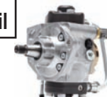
All Brands Gear, Vane Piston Pumps