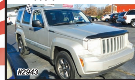
2008 JEEP LIBERTY