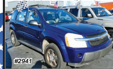
2006 CHEVY EQUINOX