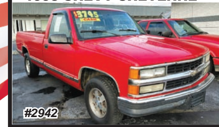
1995 CHEVY CHEYENNE