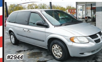
2003 DODGE CARAVAN

www.fannmotorsgallatin.com • And on FACEBOOK