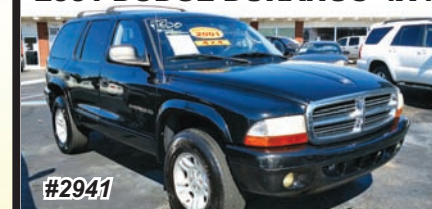
2001 DODGE DURANGO 4X4