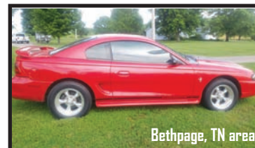
Bethpage, TN area