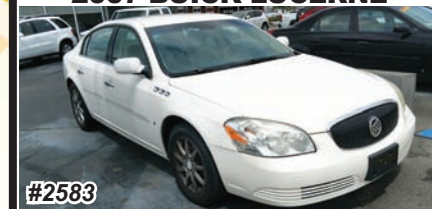
2007 BUICK LUCERNE