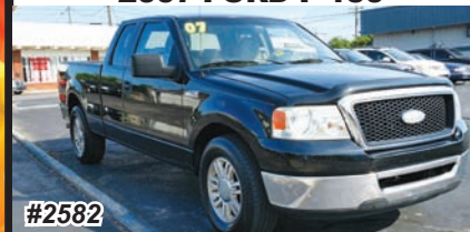
2007 FORD F-150

ESTABLISH OR REBUILD YOUR CREDIT... WE CAN GET YOU FINANCED!