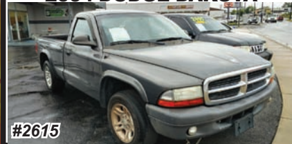
2004 DODGE DAKOTA