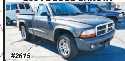
2004 DODGE DAKOTA