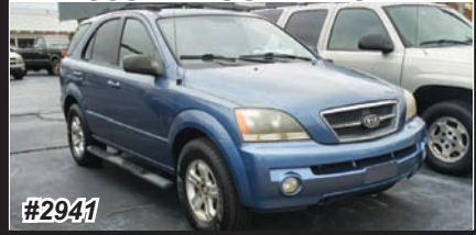
2005 KIA SORENTO EX