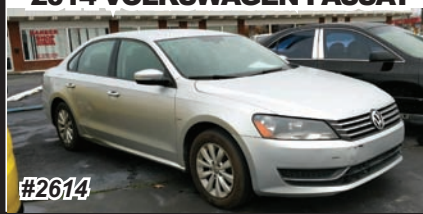
2014 VOLKSWAGEN PASSAT