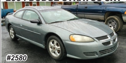
2004 DODGE STRATUS SXT