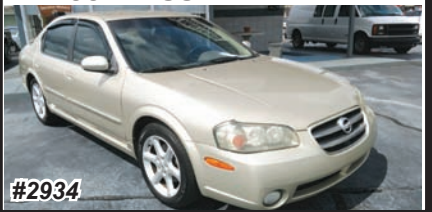
2002 NISSAN MAXIMA