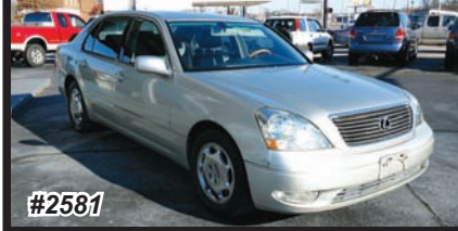
2001 LEXUS LS 430