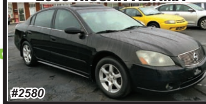
2005 NISSAN ALTIMA