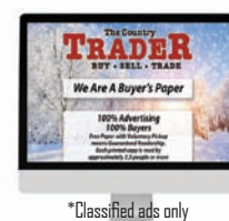
*Classified ads only

PLACE YOUR AD* ONLINE ANYTIME! VIEW THE TRADER ONLINE ANYTIME! WWW.COUNTRYTRADERONLINE.COM