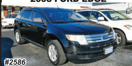
2008 FORD EDGE