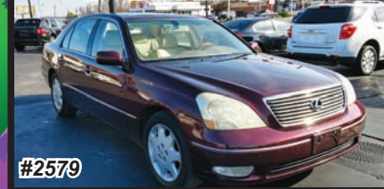
2002 LEXUS LS430