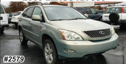
2005 LEXUS RX 330