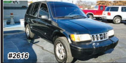
2002 KIA SPORTAGE