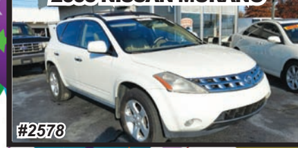
2005 NISSAN MURANO