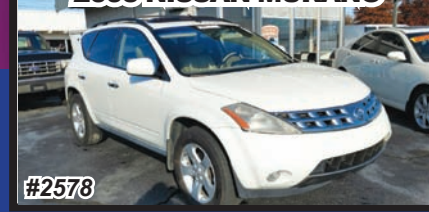
2005 NISSAN MURANO