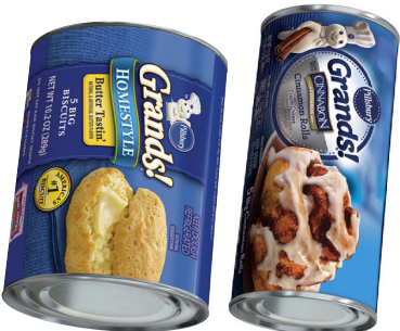
Pillsbury Grands Biscuits or Cinnamon Rolls 4-10.2 oz. can