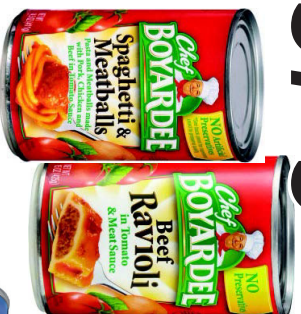
Chef Boyardee Canned Pasta 14.5-15 oz., Assorted Varieties