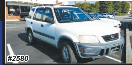
2001 HONDA CR-V LX