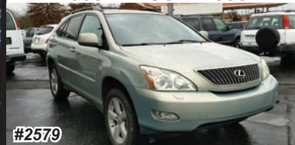
2005 LEXUS RX 330