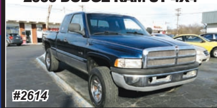
2000 DODGE RAM ST 4X4