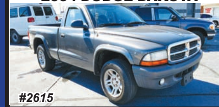
2004 DODGE DAKOTA