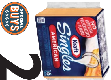
Kraft American Singles 12 oz.