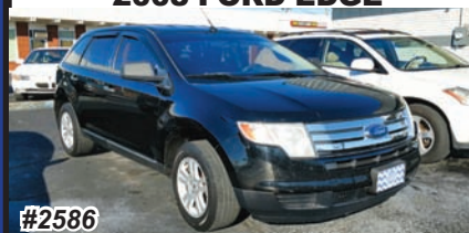
2008 FORD EDGE