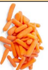
1 lb. Mini Carrots