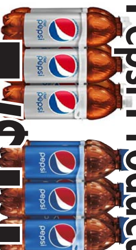
6 pack, 16.9 oz., Assorted Pepsi Products