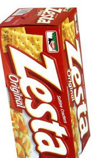
Zesta Saltine Crackers 16 oz.