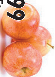
3 lb. Gala Apples