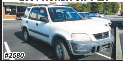
2001 HONDA CR-V LX