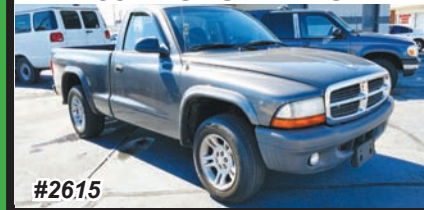
2004 DODGE DAKOTA