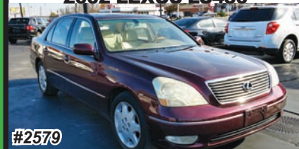
2002 LEXUS LS430