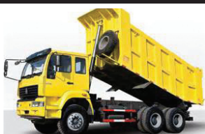
Lift Cylinder Repair