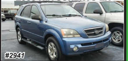
2005 KIA SORENTO EX