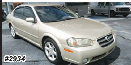
2002 NISSAN MAXIMA