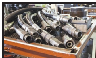
Bridgestone Hoses & Fittings

All vehicles pre-owned. $150 doc fee additional + T.T & L. Some units may be sold due to advertising deadlines.