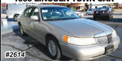
1999 LINCOLN TOWN CAR