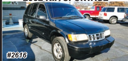
2002 KIA SPORTAGE