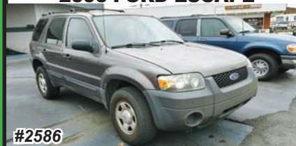
2006 FORD ESCAPE