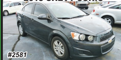
2015 CHEVY SONIC