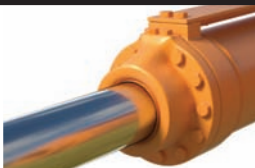
All Types of Cylinders