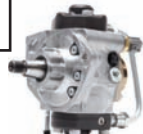
All Brands Gear, Vane Piston Pumps