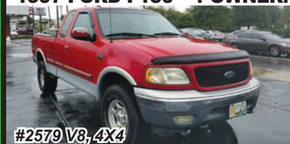
1997 FORD F150 • 1 OWNER!