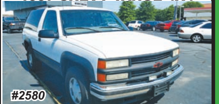
1997 CHEVY TAHOE 4X4