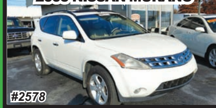
2005 NISSAN MURANO