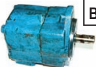
All Brands Hydraulic Motors