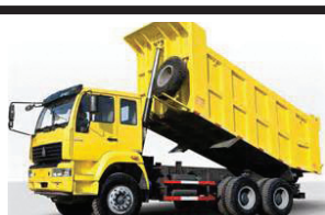
Lift Cylinder Repair