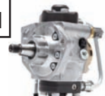
All Brands Gear, Vane Piston Pumps