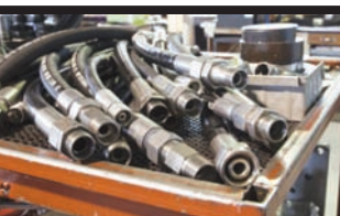
Bridgestone Hoses & Fittings

All vehicles pre-owned, prices +ttl. $299 Doc Fee. Due to advertising deadlines, some units may be sold.