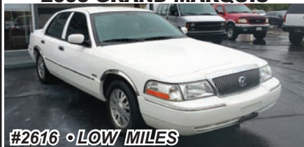
2005 GRAND MARQUIS