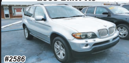
2005 BMW X5