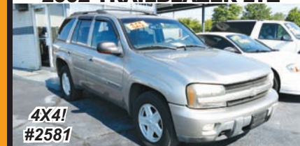
2002 TRAILBLAZER LTZ