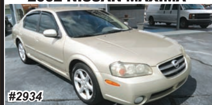
2002 NISSAN MAXIMA