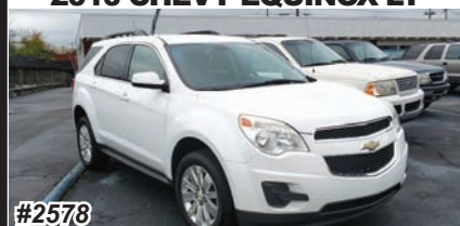
2010 CHEVY EQUINOX LT