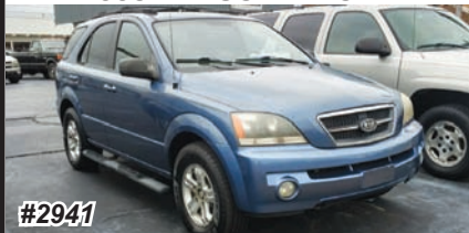
2005 KIA SORENTO EX