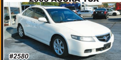
2005 ACURA TSX