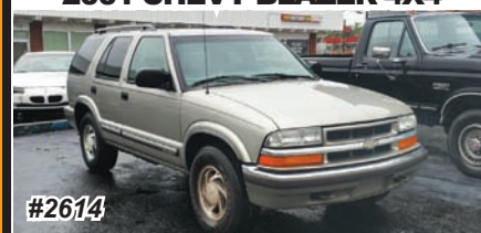
2001 CHEVY BLAZER 4X4