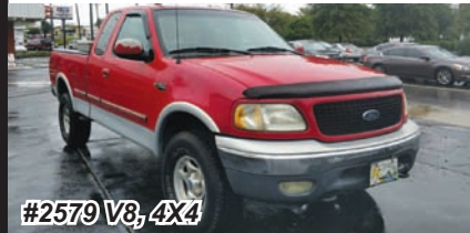
1997 FORD F150 • 1 OWNER!