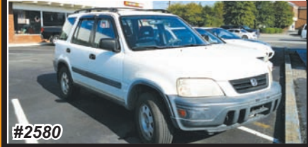
2001 HONDA CR-V LX