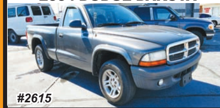
2004 DODGE DAKOTA