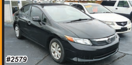
2012 HONDA CIVIC LX