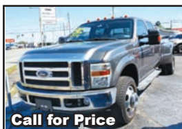
Call for Price

'08 FORD F350 4X4 Diesel, Low Miles #1004