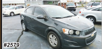
2015 CHEVY SONIC