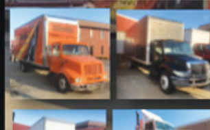
For More Information Visit RONGREGORYREALTYAUCTIONINC.COM