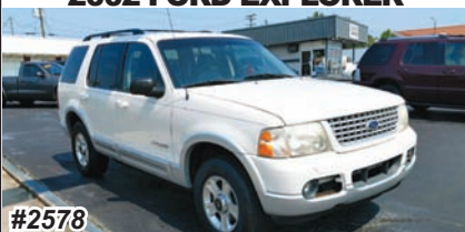
2002 FORD EXPLORER