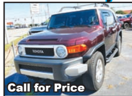
Call for Price