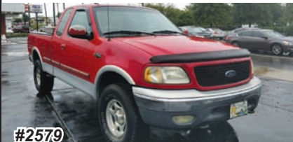
1997 FORD F150 • 1 OWNER!