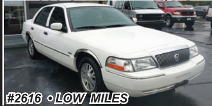
2005 GRAND MARQUIS