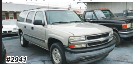
2006 CHEVY SUBURBAN