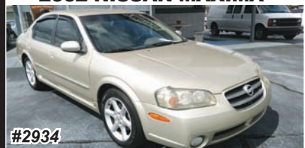
2002 NISSAN MAXIMA