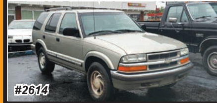
2001 CHEVY BLAZER 4X4