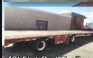
48' Flat Bed Trailer