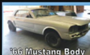
'66 Mustang Body