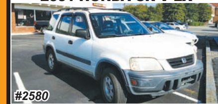
2001 HONDA CR-V LX