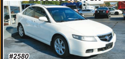
2005 ACURA TSX