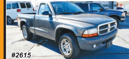
2004 DODGE DAKOTA