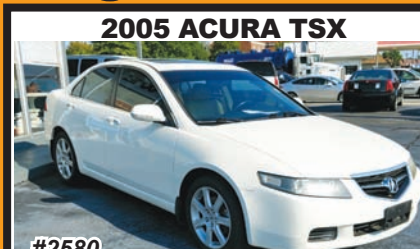
2005 ACURA TSX