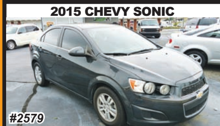
2015 CHEVY SONIC