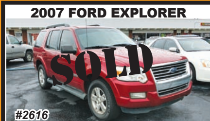
2007 FORD EXPLORER