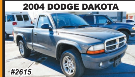
2004 DODGE DAKOTA