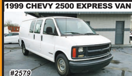
1999 CHEVY 2500 EXPRESS VAN