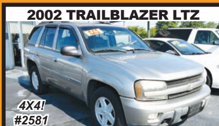
2002 TRAILBLAZER LTZ