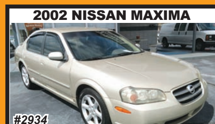
2002 NISSAN MAXIMA