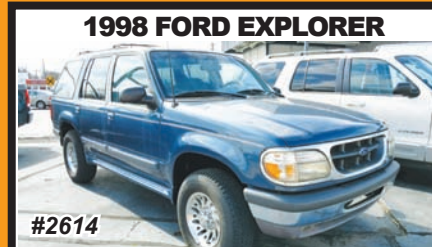
1998 FORD EXPLORER