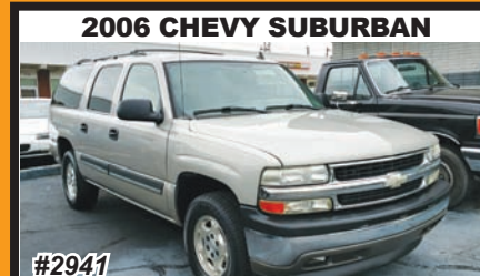
2006 CHEVY SUBURBAN