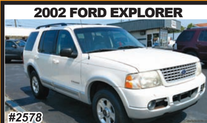
2002 FORD EXPLORER