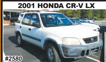
2001 HONDA CR-V LX