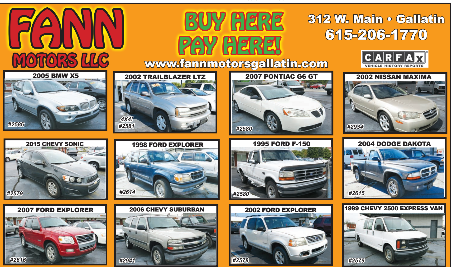
ALSO BANK FINANCING • PRICE PLUS TAX, TITLE AND LICENSE & $149 DOC FEE.

FULL SIZE MATTRESS AND BOX SPRINGS, excellent condition. $135. 615-451-2230, 09/20