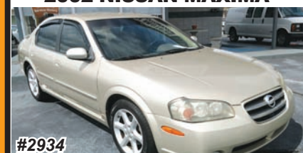
2002 NISSAN MAXIMA