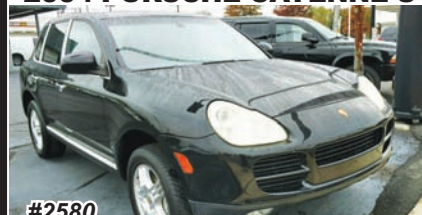
2004 PORSCHE CAYENNE S