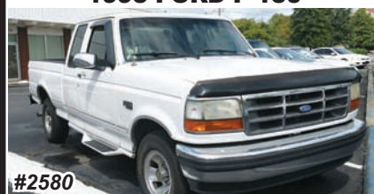
1995 FORD F-150