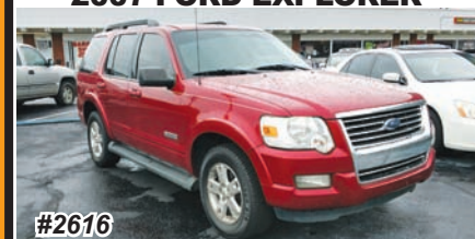
2007 FORD EXPLORER