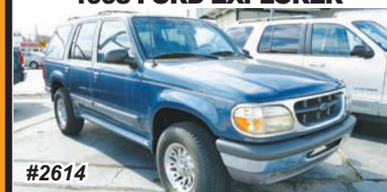
1998 FORD EXPLORER