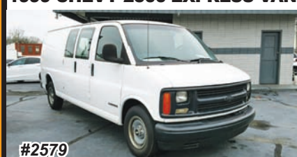
1999 CHEVY 2500 EXPRESS VAN