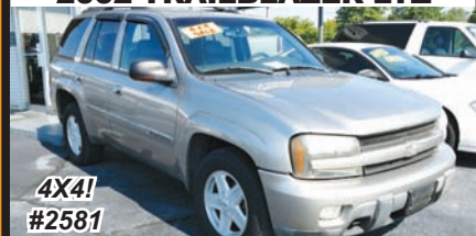
2002 TRAILBLAZER LTZ