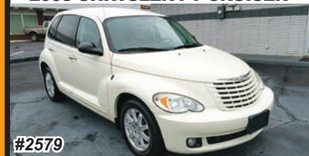
2008 CHRYSLER PT CRUISER