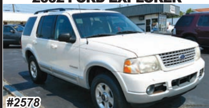
2002 FORD EXPLORER