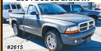
2004 DODGE DAKOTA