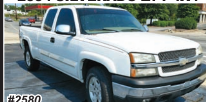
2004 SILVERADO Z71 4X4