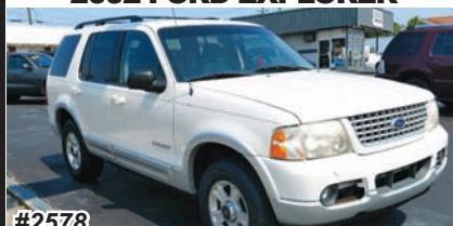
2002 FORD EXPLORER