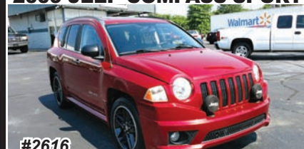
2009 JEEP COMPASS SPORT