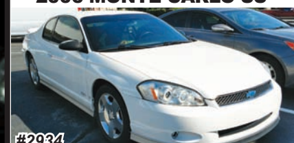
2006 MONTE CARLO SS