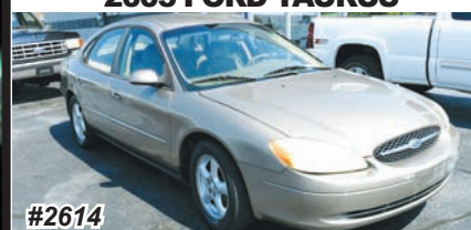
2003 FORD TAURUS