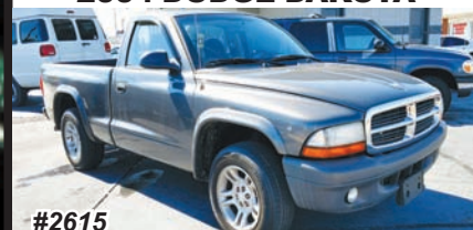
2004 DODGE DAKOTA