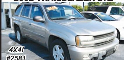
2002 TRAILBLAZER LTZ