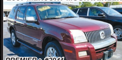
2007 MERCURY MOUNTAINEER