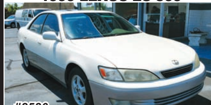
1999 LEXUS ES 300