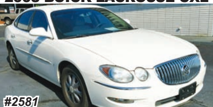
2008 BUICK LACROSSE CXL