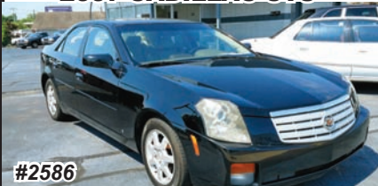
2007 CADILLAC CTS