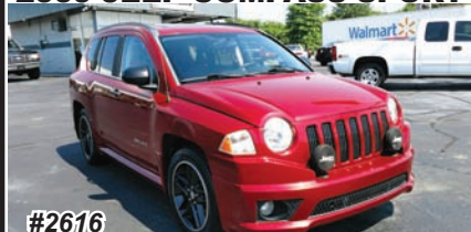
2009 JEEP COMPASS SPORT