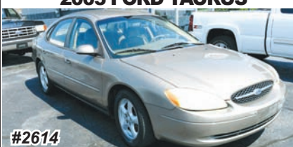
2003 FORD TAURUS