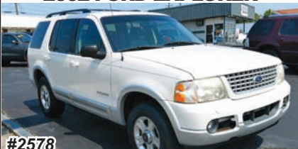
2002 FORD EXPLORER