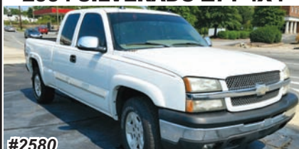
2004 SILVERADO Z71 4X4