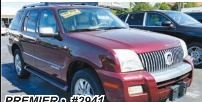
2007 MERCURY MOUNTAINEER