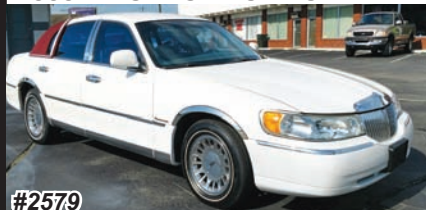
1999 LIN. TOWNCAR CARTIER