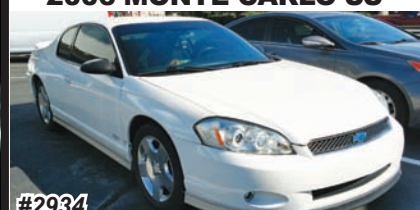
2006 MONTE CARLO SS