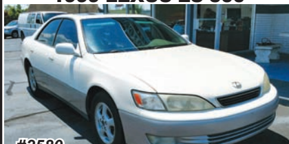
1999 LEXUS ES 300