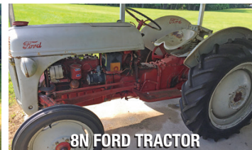
8N FORD TRACTOR

Make your plans to join the Progressive Auction Group on Saturday, July 28th at 9:30am for this Real Estate Auction opportunity located at 1842 Hiley Spencer Road , in Scottsville, Kentucky 42134 .