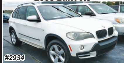
2008 BMW X5