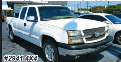
2004 SILVERADO 1500