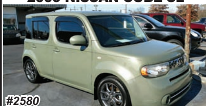
2009 NISSAN CUBE SL