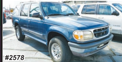
1998 FORD EXPLORER