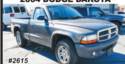
2004 DODGE DAKOTA