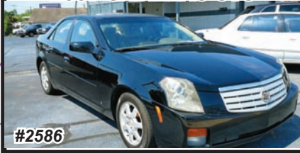
2007 CADILLAC CTS