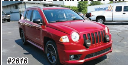
2009 JEEP COMPASS SPORT