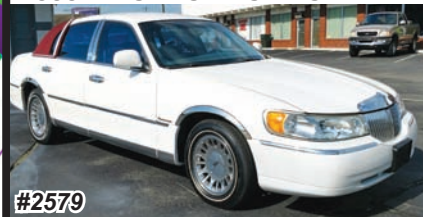
1999 LINC. TOWNCAR CARTIER