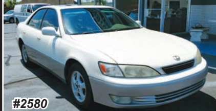
1999 LEXUS ES 300