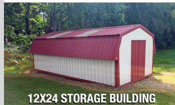
12X24 STORAGE BUILDING