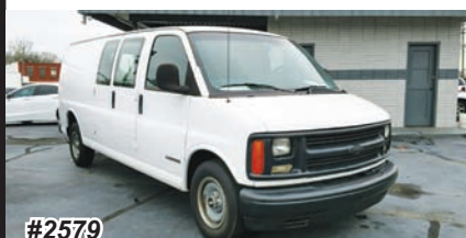
1999 CHEVY 2500 EXPRESS VAN