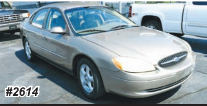
2003 FORD TAURUS