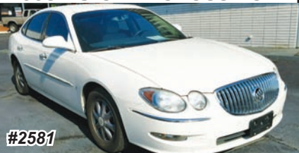
2008 BUICK LACROSSE CXL