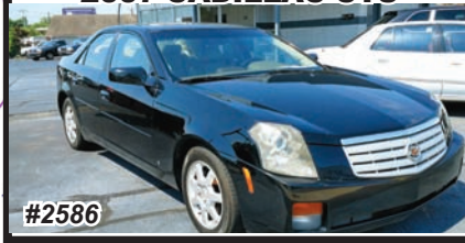
2007 CADILLAC CTS