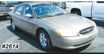
2003 FORD TAURUS