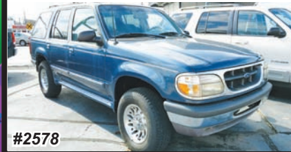
1998 FORD EXPLORER