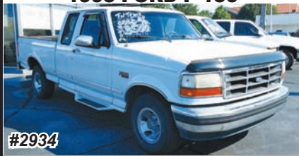
1995 FORD F-150