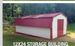
12X24 STORAGE BUILDING