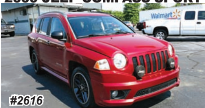
2009 JEEP COMPASS SPORT