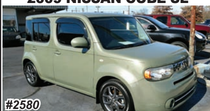
2009 NISSAN CUBE SL