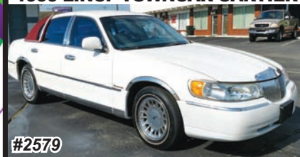
1999 LINC. TOWNCAR CARTIER