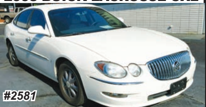
2008 BUICK LACROSSE CXL