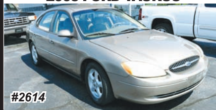
2003 FORD TAURUS