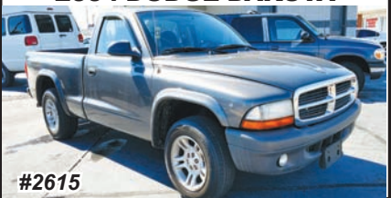
2004 DODGE DAKOTA