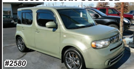
2009 NISSAN CUBE SL