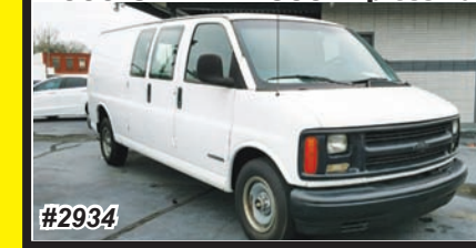
1999 CHEVY 2500 Express Van