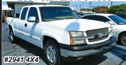
2004 SILVERADO 1500