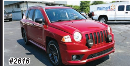
2009 JEEP COMPASS SPORT