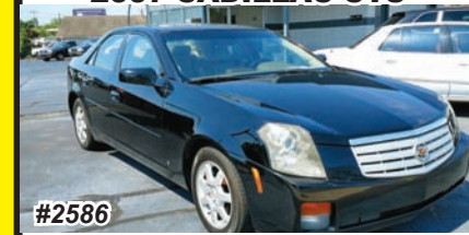
2007 CADILLAC CTS