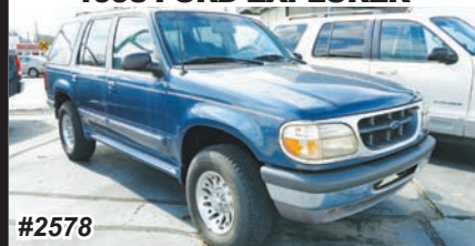
1998 FORD EXPLORER