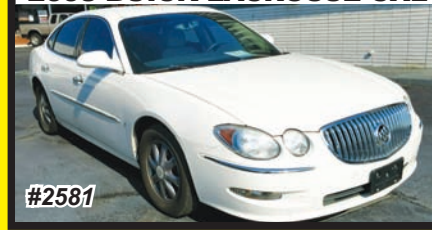
2008 BUICK LACROSSE CXL