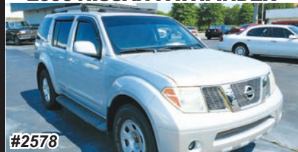
2006 NISSAN PATHFINDER