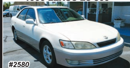
1999 LEXUS ES 300