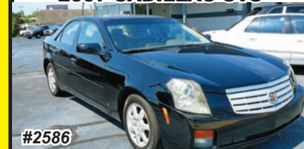
2007 CADILLAC CTS