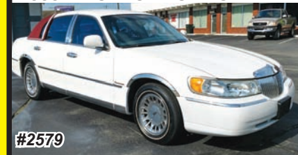
1999 LINC. TOWNCAR CARTIER