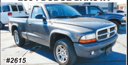
2004 DODGE DAKOTA