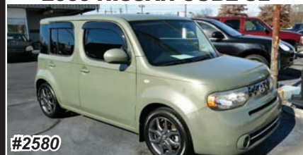
2009 NISSAN CUBE SL