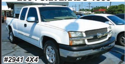
2004 SILVERADO 1500