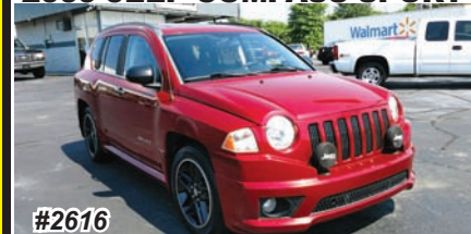
2009 JEEP COMPASS SPORT