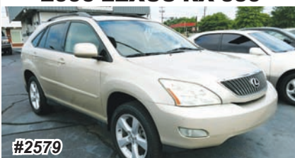
2006 LEXUS RX 330