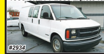
1999 CHEVY 2500 Express Van