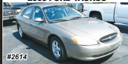
2003 FORD TAURUS