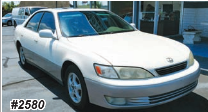
1999 LEXUS ES 300