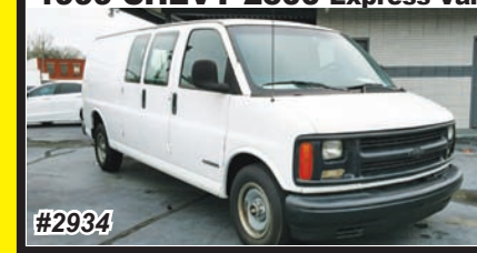
1999 CHEVY 2500 Express Van