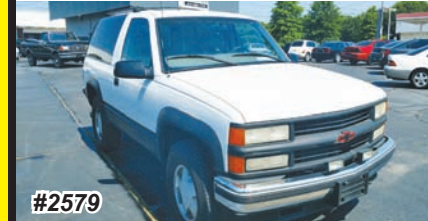
1997 CHEVY TAHOE LT