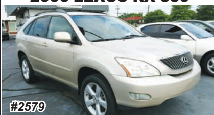
2006 LEXUS RX 330