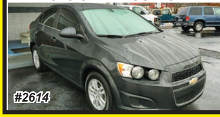
2015 CHEVY SONIC LT