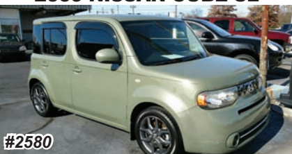
2009 NISSAN CUBE SL