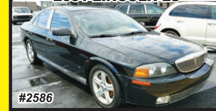
2001 LINCOLN LS