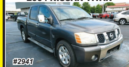
2004 NISSAN TITAN