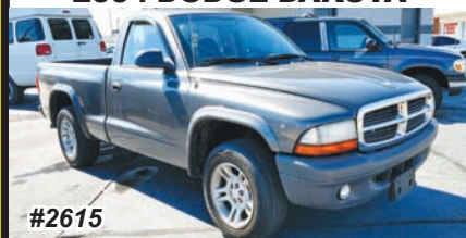
2004 DODGE DAKOTA