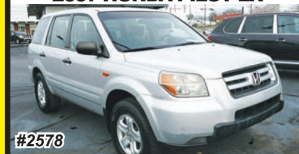
2007 HONDA PILOT LX