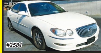
2008 BUICK LACROSSE CXL