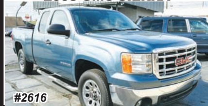
2008 GMC SIERRA