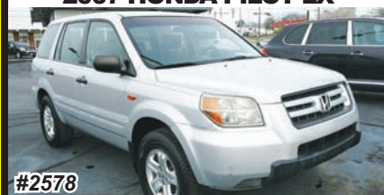
2007 HONDA PILOT LX