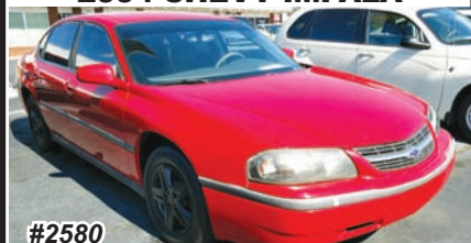
2004 CHEVY IMPALA