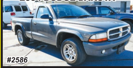
2004 DODGE DAKOTA