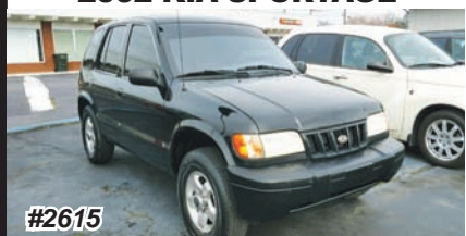
2002 KIA SPORTAGE