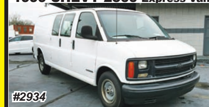
1999 CHEVY 2500 Express Van