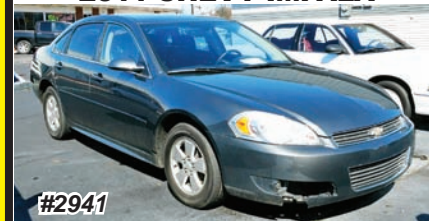
2011 CHEVY IMPALA