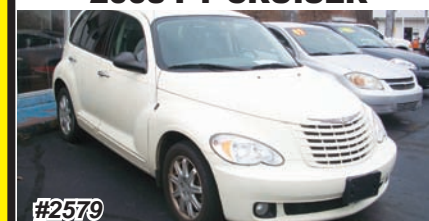
2008 PT CRUISER