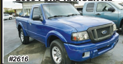
2005 FORD RANGER XL