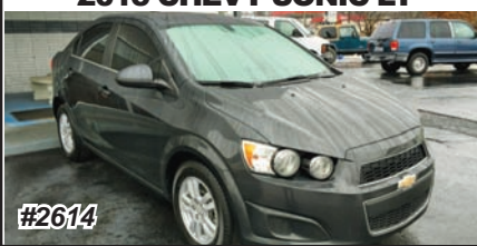
2015 CHEVY SONIC LT