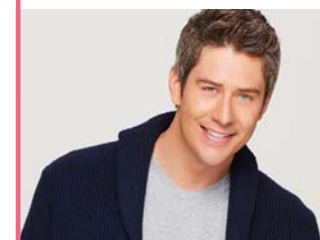
MEET ARIE LUYENDYK from the bachelor

thu 10a-7p fri 10a-8p sat 10a-7p sun 11a-6p