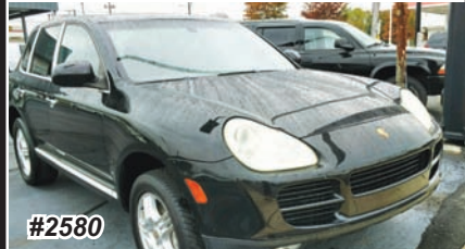
2004 PORSCHE CAYENNE S