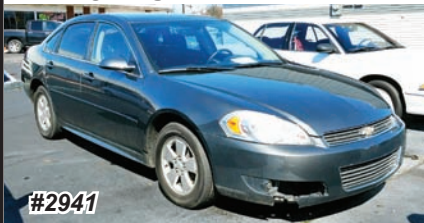
2011 CHEVY IMPALA