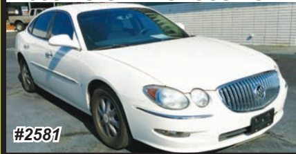
2008 BUICK LACROSSE CXL