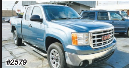
2008 GMC SIERRA 1500