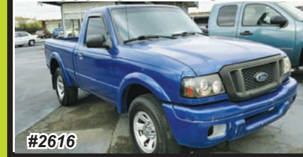
2005 FORD RANGER XL