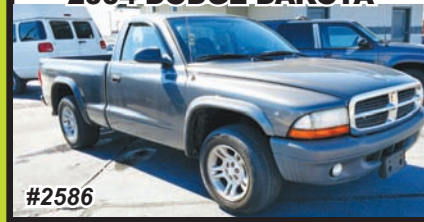
2004 DODGE DAKOTA