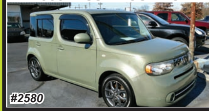
2009 NISSAN CUBE SL