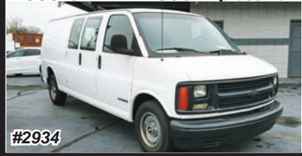
1999 CHEVY 2500 Express Van