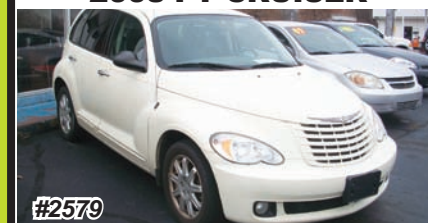
2008 PT CRUISER