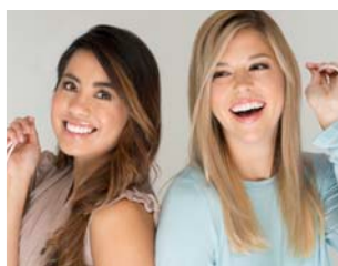
SHOP 'TIL YOU DROP all weekend