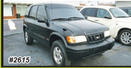
2002 KIA SPORTAGE