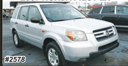
2007 HONDA PILOT LX