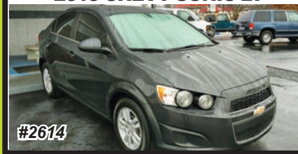
2015 CHEVY SONIC LT