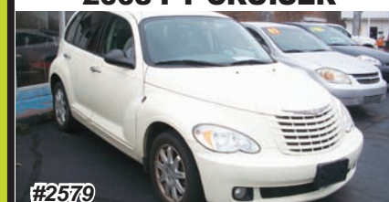
2008 PT CRUISER