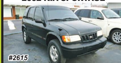
2002 KIA SPORTAGE