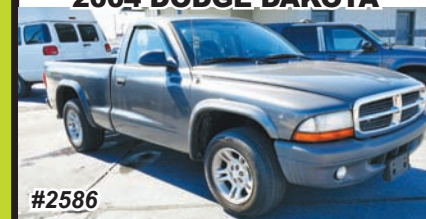
2004 DODGE DAKOTA