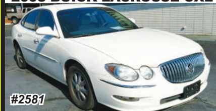
2008 BUICK LACROSSE CXL