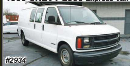
1999 CHEVY 2500 Express Van