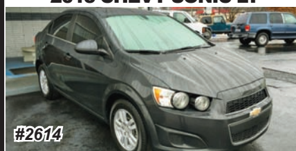
2015 CHEVY SONIC LT