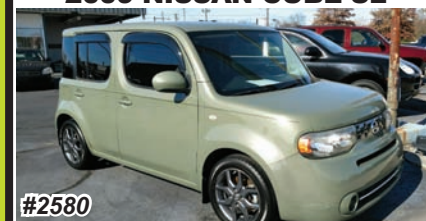
2009 NISSAN CUBE SL