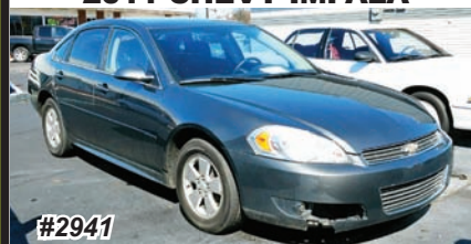
2011 CHEVY IMPALA