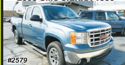
2008 GMC SIERRA 1500