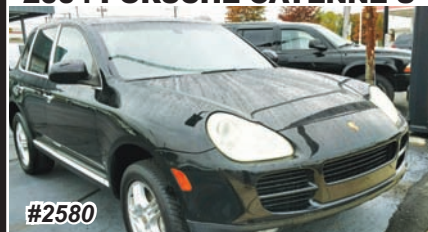
2004 PORSCHE CAYENNE S