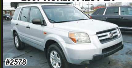
2007 HONDA PILOT LX