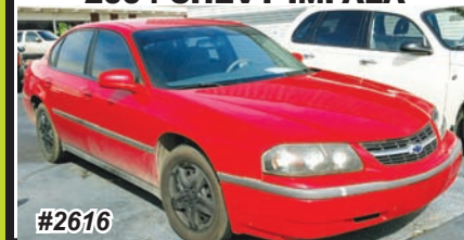
2004 CHEVY IMPALA