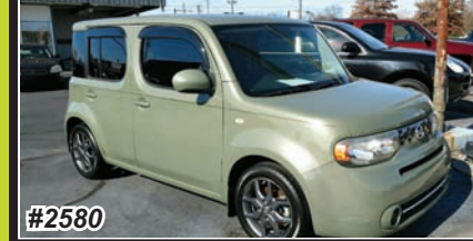
2009 NISSAN CUBE SL