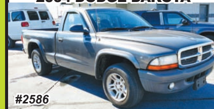
2004 DODGE DAKOTA