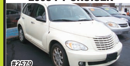
2008 PT CRUISER