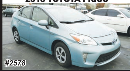
2013 TOYOTA PRIUS