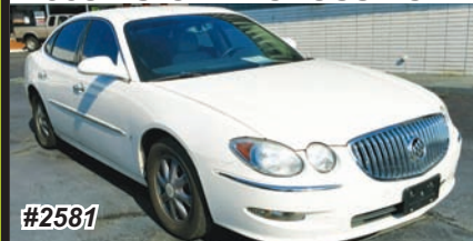
2008 BUICK LACROSSE CXL