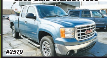
2008 GMC SIERRA 1500