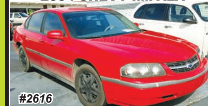
2004 CHEVY IMPALA