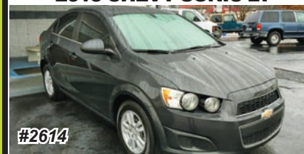
2015 CHEVY SONIC LT