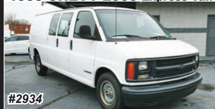
1999 CHEVY 2500 Express Van