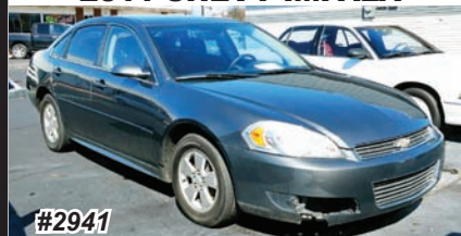
2011 CHEVY IMPALA