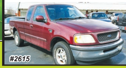
1998 FORD F150