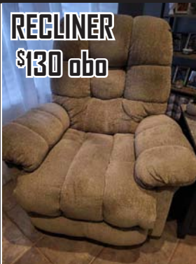
RECLINER $130 obo