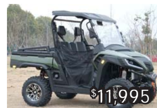
$11,995 Panther 550 UTV