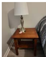
2 TABLES $30 each