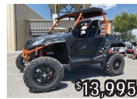
$13,995 NEW 2021 ODES Sport Cross 1000 UTV