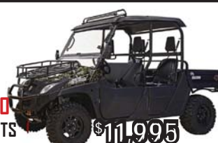
$11,995 Massimo MSU 850 UTV