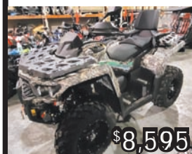
$8,595 NEW 2022 BENNCHE Path Cross 650i ATV