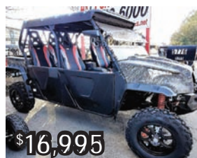
$16,995 NEW 2022 ODES Jungle Cross 800cc LT-5

Open Tues - Sat 11am-6pm ■ ½ mile west of Hwy 109 ■ ½ mile from I-40