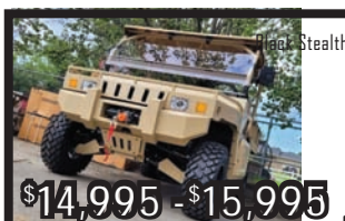
$14,995 - $15,995 2022 NEW ODES Desert Cross 800, 1000