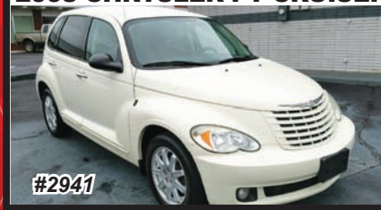
2008 CHRYSLER PT CRUISER