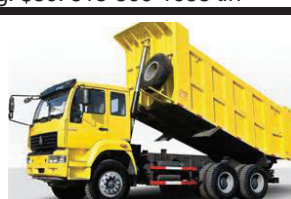
Lift Cylinder Repair