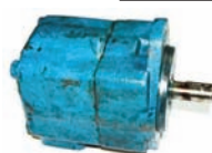
All Brands Hydraulic Motors