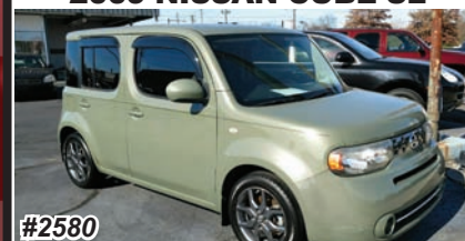
2009 NISSAN CUBE SL