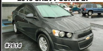
2015 CHEVY SONIC LT