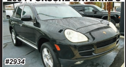
2004 PORSCHE CAYENNE S