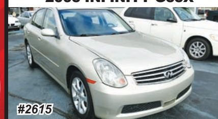
2005 INFINITY G35X