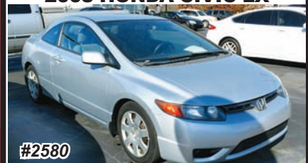
2008 HONDA CIVIC LX