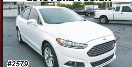
2013 FORD FUSION