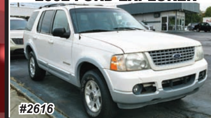
2002 FORD EXPLORER