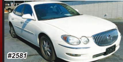
2008 BUICK LACROSSE CXL