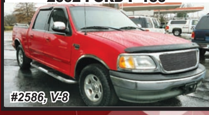
2002 FORD F-150