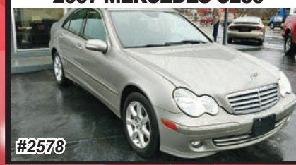
2007 MERCEDES C280