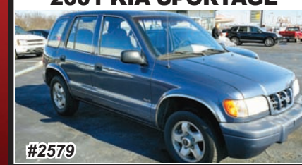
2001 KIA SPORTAGE