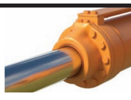
All Types of Cylinders