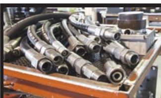
Bridgestone Hoses & Fittings

All vehicles pre-owned • Prices plus T.T.L. $0 doc fee