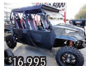
$16,995 NEW 2022 ODES Jungle Cross 800cc LT-5

Open Tues - Sat 11am-6pm ■ ½ mile west of Hwy 109 ■ ½ mile from I-40