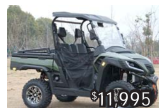
$11,995 Panther 550 UTV