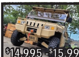
$14,995 - $15,995 2022 NEW ODES Desert Cross 800, 1000