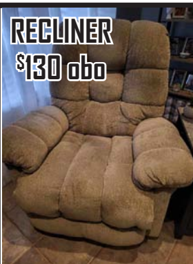
RECLINER $130 obo