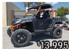
$13,995 NEW 2021 ODES Sport Cross 1000 UTV