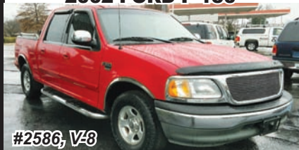
2002 FORD F-150