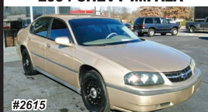
2004 CHEVY IMPALA