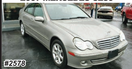
2007 MERCEDES C280