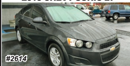
2015 CHEVY SONIC LT