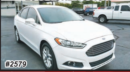
2013 FORD FUSION