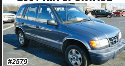
2001 KIA SPORTAGE