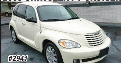
2008 CHRYSLER PT CRUISER