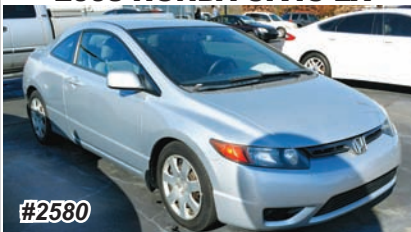
2008 HONDA CIVIC LX