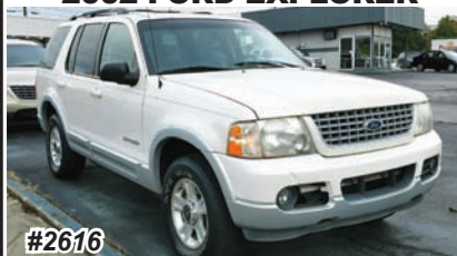
2002 FORD EXPLORER