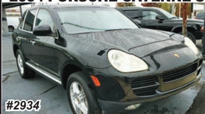
2004 PORSCHE CAYENNE S