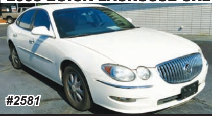
2008 BUICK LACROSSE CXL