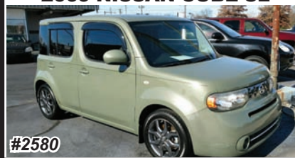
2009 NISSAN CUBE SL