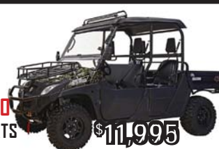
$11,995 Massimo MSU 850 UTV