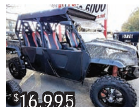
$16,995 NEW 2022 ODES Jungle Cross 800cc LT-5

Open Tues - Sat 11am-7pm • ½ mile west of Hwy 109 • ½ mile from I-40