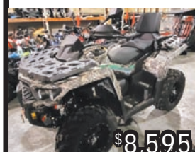
$8,595 NEW 2022 BENNECHE Path Cross 650i ATV

RABBITS FOR SALE. Approx. 4 months old and some older. Mother is a Lionhead and father is a white rabbit. Most have manes. Some are black and white. $15 each. 615-394-6768