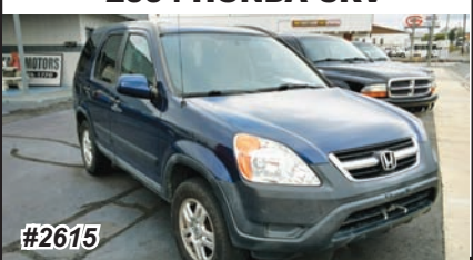
2004 HONDA CRV