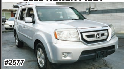
2009 HONDA PILOT