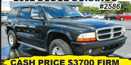
2002 DODGE DURANGO