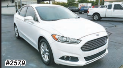
2013 FORD FUSION