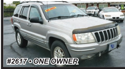
2000 JEEP GR. CHEROKEE