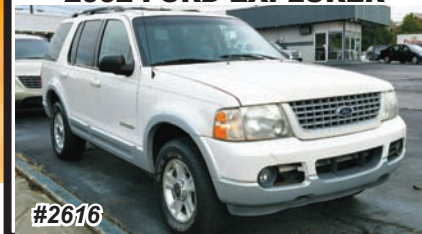
2002 FORD EXPLORER