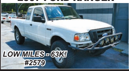
2007 FORD RANGER