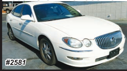
2008 BUICK LACROSSE CXL