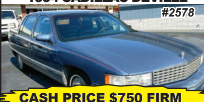
1994 CADILLAC DEVILLE