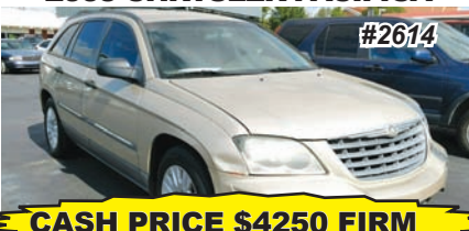
2005 CHRYSLER PACIFICA