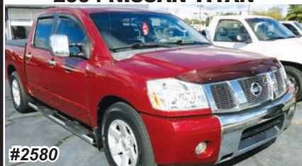
2004 NISSAN TITAN