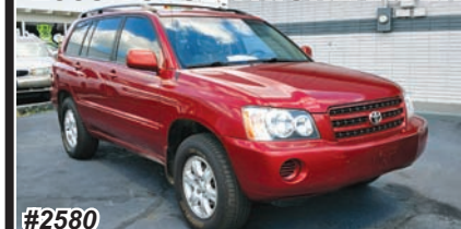
2003 TOYOTA HIGHLANDER