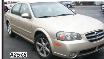
2002 NISSAN MAXIMA