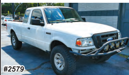
2007 FORD RANGER