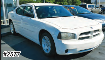
2006 DODGE CHARGER