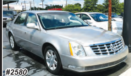
2006 CADILLAC DTS