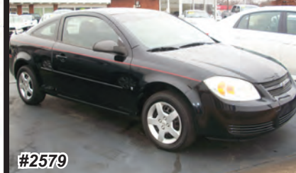
2007 CHEVY COBALT