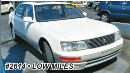
1996 LEXUS CLASSIC