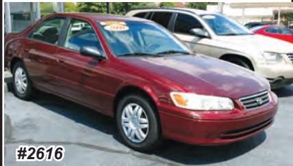
2000 TOYOTA CAMRY