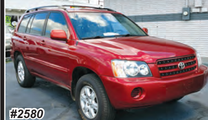
2003 TOYOTA HIGHLANDER