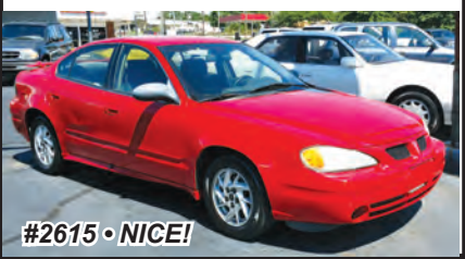
2003 PONTIAC GRAND AM