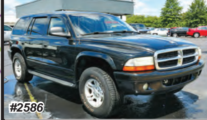
2002 DODGE DURANGO