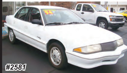
1994 BUICK SKYLARK