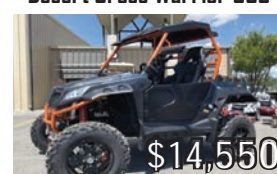
2022 NEW Massimo Desert Cross Warrior 800