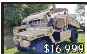
NEW 2022 ODES Black Stealth or Desert Tan Desert Warrior 1000