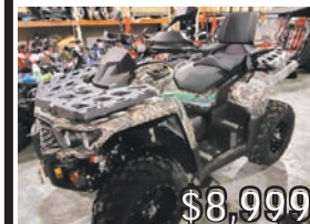
NEW 2022 BENNECHE Path Cross 650i ATV