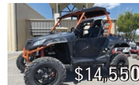
2022 NEW Massimo Desert Cross Warrior 800