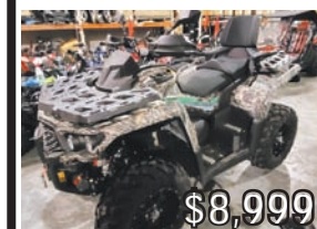
NEW 2022 BENNCHE Path Cross 650i ATV

16 FT TANDEM TRAILER, excellent condition. $2000. 615-491-7702 tfn