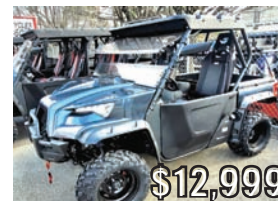
NEW 2022 ODES JungleCross ST 800cc 2 seater