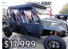
NEW 2022 ODES Jungle Cross 800cc LT-5 Blue, Black, Camo

Open Tues - Sat 11am-7pm • ½ mile west of Hwy 109 • ½ mile from I-40