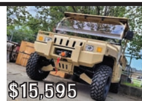
2022 NEW Massimo Desert Cross Warrior 800