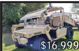
NEW 2022 ODES Black Stealth Desert Warrior 1000 or Desert Tan