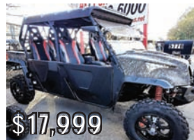
$17,999 NEW 2022 ODES Jungle Cross 800cc LT-5 Blue, Black, Camo

■ MOTORCYCLES ■ ATV ■ UTV ■ SCOOTERS ■ DIRT BIKES ■ GO CARTS Open Tues - Sat 11am-7pm • ½ mile west of Hwy 109 • ½ mile from I-40