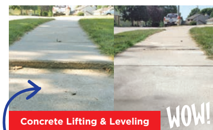
Concrete Lifting & Leveling