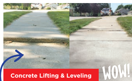
Concrete Lifting &amp; Leveling