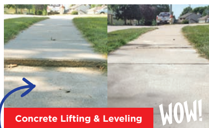
Concrete Lifting & Leveling