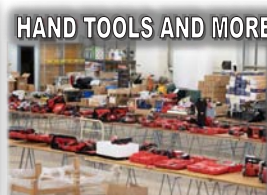
HAND TOOLS AND MORE

TERMS: CASH - GOOD CHECK - VISA/MASTERCARD. 15% BUYER'S PREMIUM. PURCHASING ALL ITEMS AS-IS WITH NO RECOURSE TO SELLER OR AUCTIONEER.