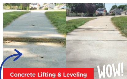
Concrete Lifting & Leveling