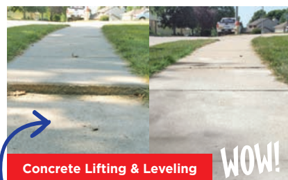
Concrete Lifting & Leveling