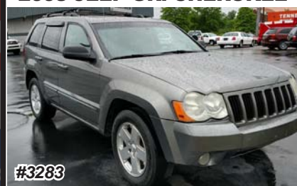
2008 JEEP GR. CHEROKEE