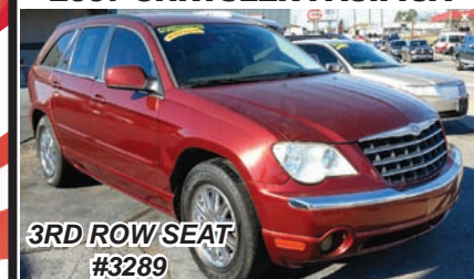
2007 CHRYSLER PACIFICA