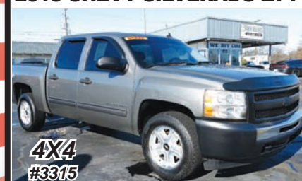
2013 CHEVY SILVERADO Z71