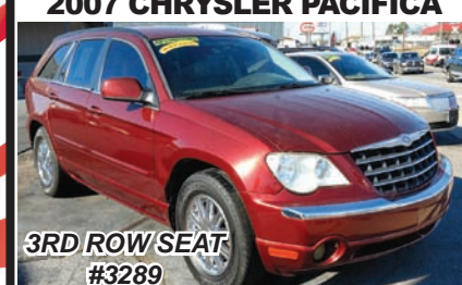
2007 CHRYSLER PACIFICA