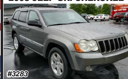
2008 JEEP GR. CHEROKEE