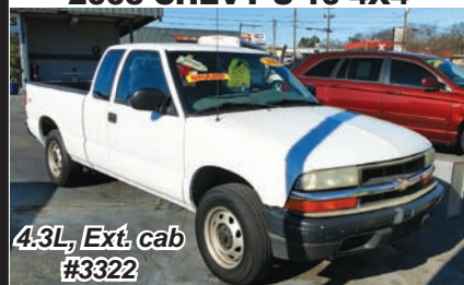
2003 CHEVY S-10 4X4