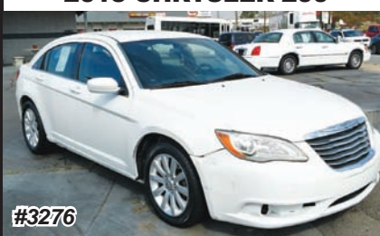
2013 CHRYSLER 200