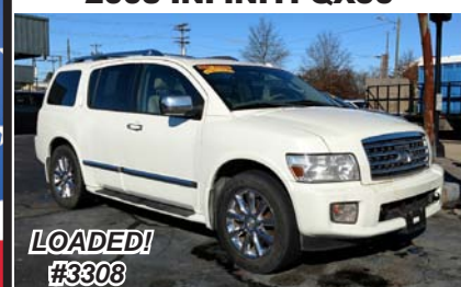
2008 INFINITI QX56

www.fannmotorsgallatin.com • And on FACEBOOK