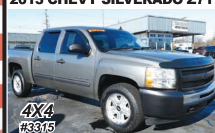
2013 CHEVY SILVERADO Z71