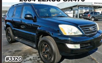
2004 LEXUS GX470