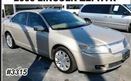
2006 LINCOLN ZEPHYR