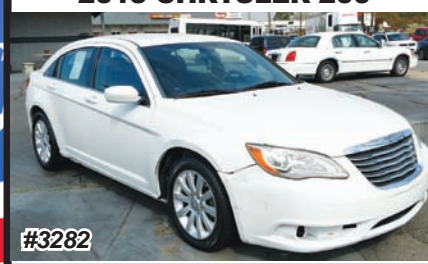
2013 CHRYSLER 200

FANN MOTORS LLC BUY HERE PAY HERE or BANK FINANCING AVAILABLE! 312 W. Main • Gallatin 615-206-1770 www.fannmotorsgallatin.com • And on FACEBOOK