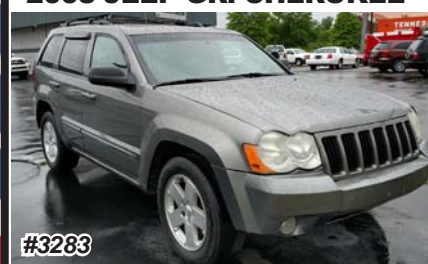
2008 JEEP GR. CHEROKEE