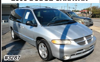
2000 DODGE CARAVAN