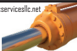
All Types of Cylinders