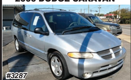
2000 DODGE CARAVAN