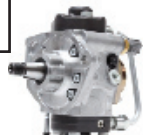
All Brands Gear, Vane Piston Pumps