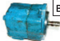
All Brands Hydraulic Motors