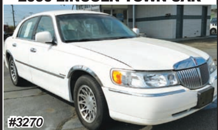
2000 LINCOLN TOWN CAR