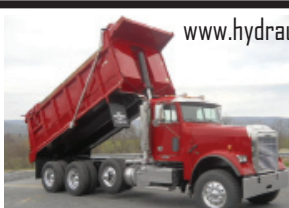
Lift Cylinder Repair