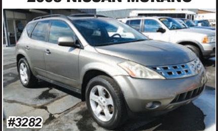
2003 NISSAN MURANO