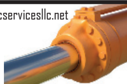
All Types of Cylinders