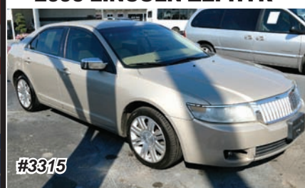
2006 LINCOLN ZEPHYR