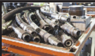
Bridgestone Hoses &amp; Fittings