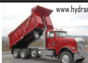
Lift Cylinder Repair