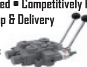
All Brands Gear, Vane Piston Pumps

FARM FRESH EGGS. Only $2.50/dz. Oak Grove area by TN/KY state line. 615-681-7392 tfn