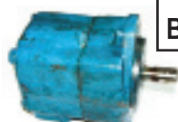
All Brands Hydraulic Motors