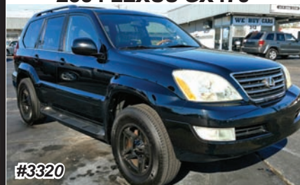
2004 LEXUS GX470

www.fannmotorsgallatin.com • And on FACEBOOK