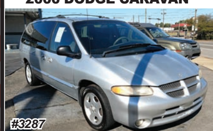
2000 DODGE CARAVAN