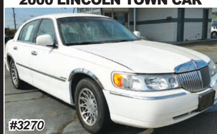
2000 LINCOLN TOWN CAR