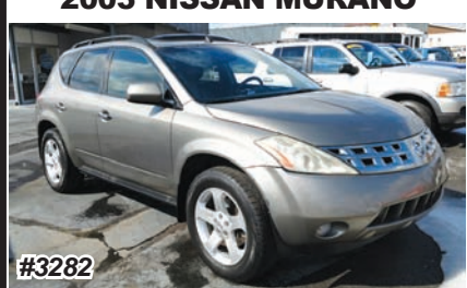
2003 NISSAN MURANO